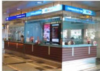
Go straight and you will find the booth of Banks for currency exchange.