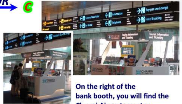
On the right of the bank booth, you will find the Changi Airport counter.