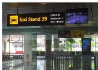
You can go directly to "Taxi Stand 3A" to the hotel.

arrange limo/ private car transfer (Each ride costs SGD30)