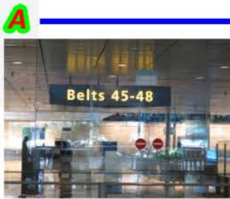
When you come out from TERMINAL 3 -- exit that close to Belts 45-48.